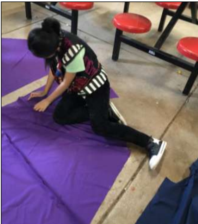
Working on the Purple Cloak Of Mystery