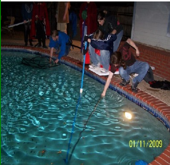
Let 's try 2 poles...