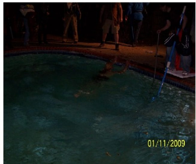
I got it! ... Now get me outta here!