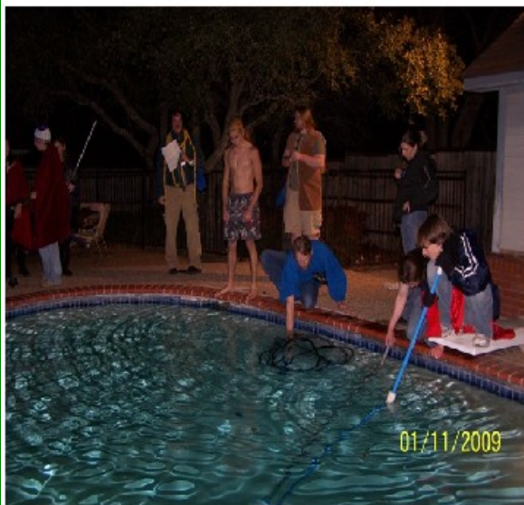
I'm just gonna do it!