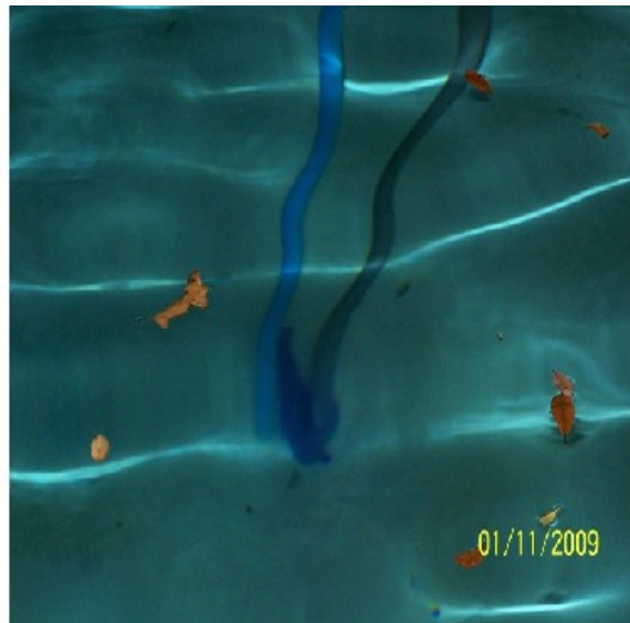
Its moving.... FAIL