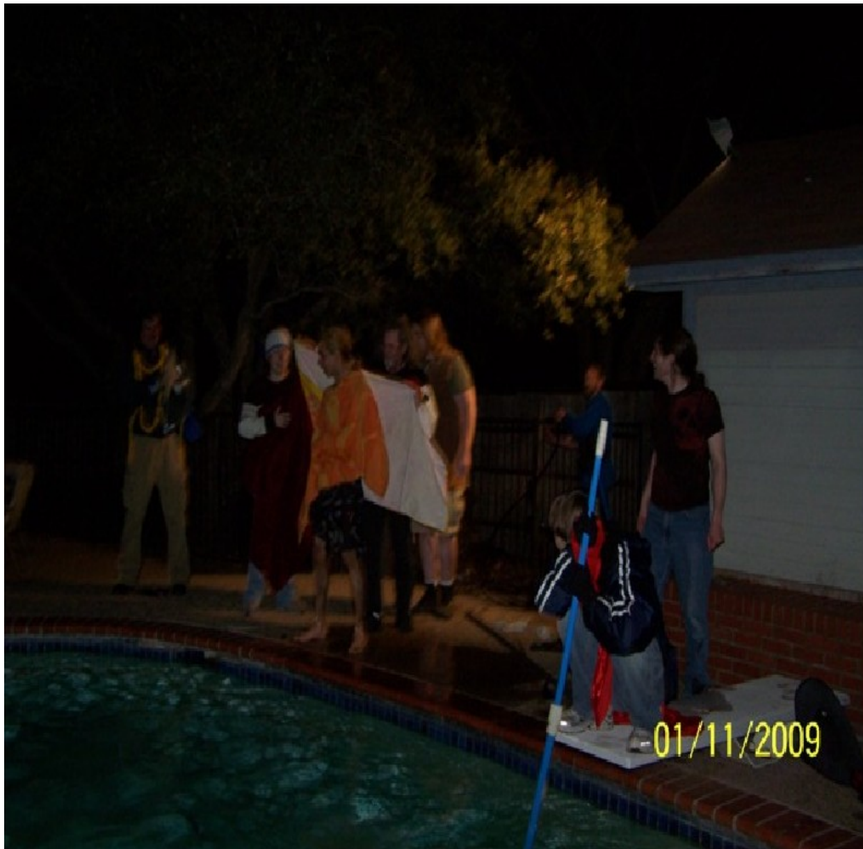
Hail the conquering hero!! ... cold and wet but a hero nevertheless