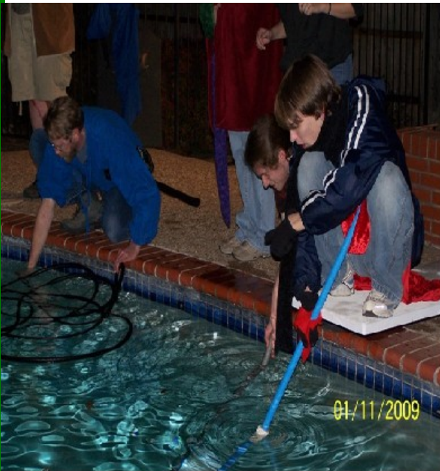
Let's try the hose again...