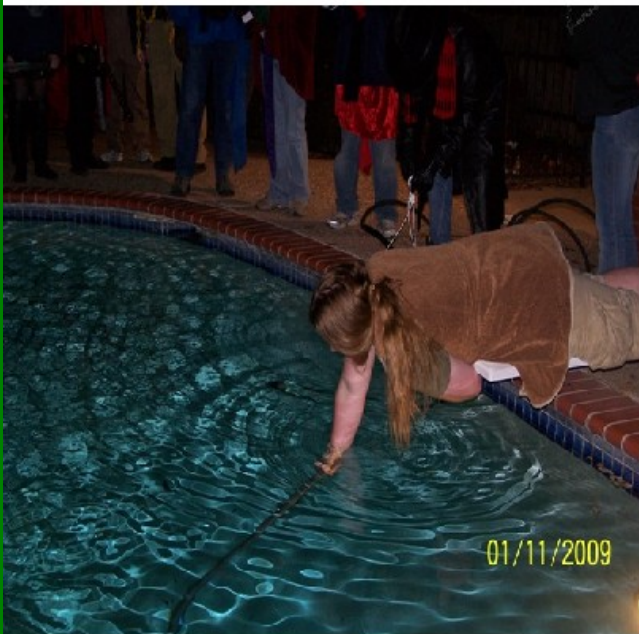
Try harder. You're not even wet yet