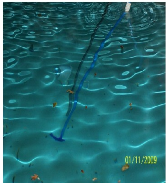
So close..... FAIL