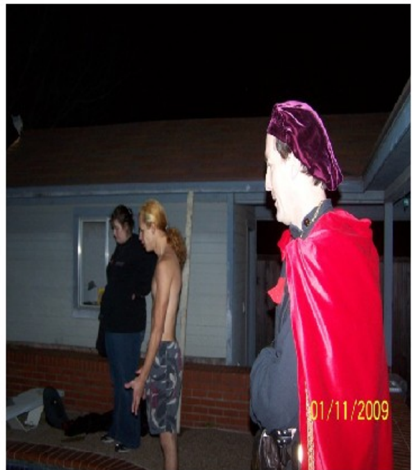
Cm'on! Let me do it.....